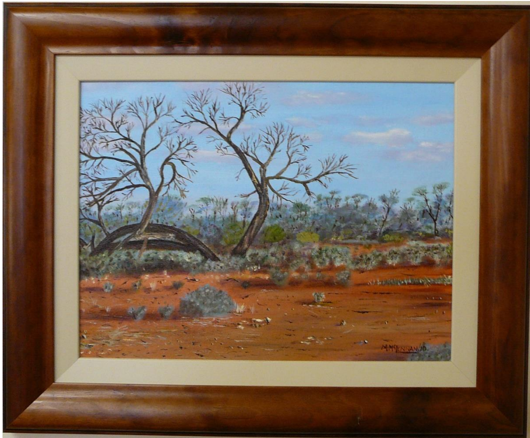
Glendambo Scrub Oil