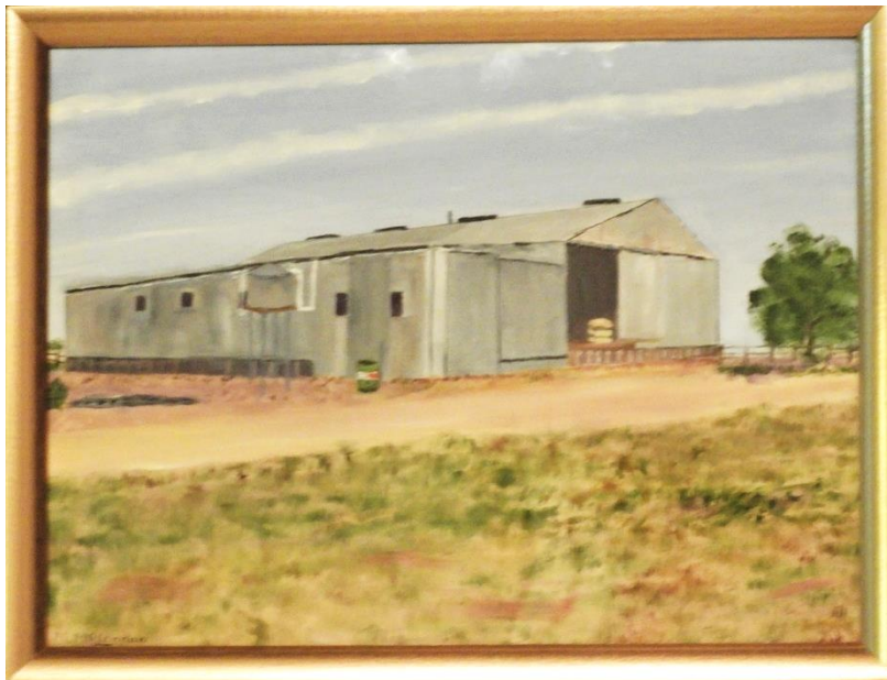
Shearing Shed "Sunnybrae" Oil