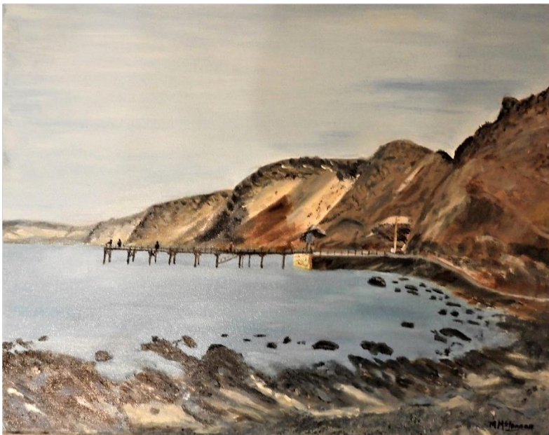
Second Valley South Australia Oil