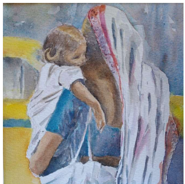
"Sleepy" 2011 Watercolour