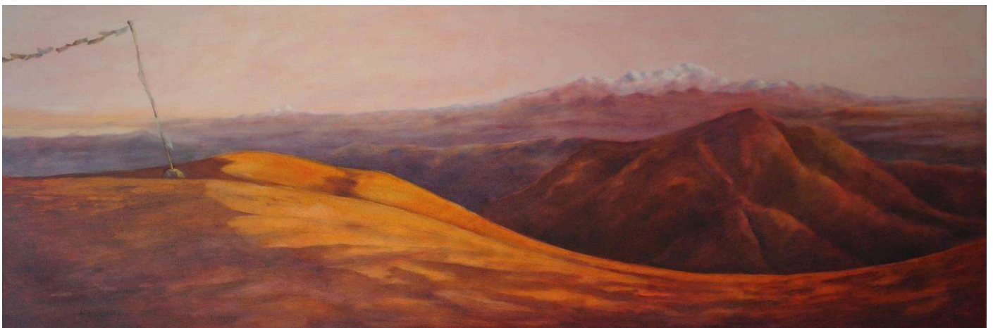
'Singalila Sunrise' 2011 Oil