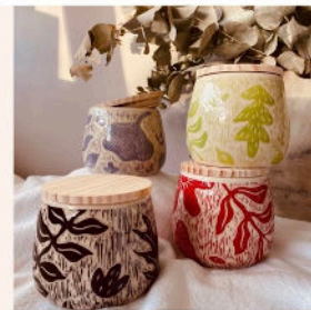
Herbarium - jar with lid