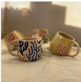
Pink coral series - mug