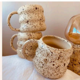
Wavy mug - white bark